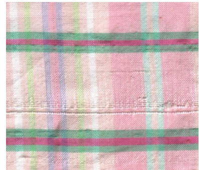
Pink/Peach/Mint 100% Silk 45"