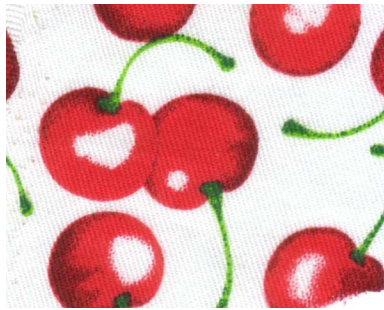
Bright Red Cherry 100% Cotton 45"